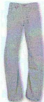
Levi's 013 Guys Action Shaped Jean "Stone Gray" £66 £40