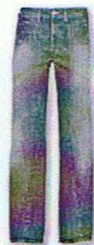
Levi's 10127 Guys Shoecut Jean "Garage Finish" £59