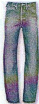
Levi's 10131 Guys Icon Shaped Jean "Garage Finish" £59