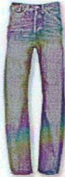
Levi's 10131 Guys Icon Shaped Jean "All The Time" £57 £45