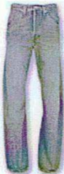
Levi's 10132 Guys Utility Shaped Jean "All The Time" £53